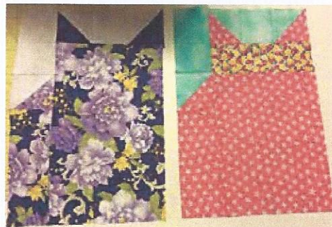
Make 3 HST