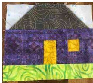
Flip and Turn Method